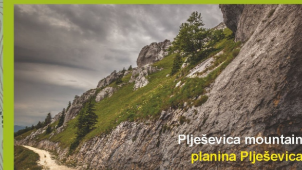
Plješevica mountain planina Plješevica