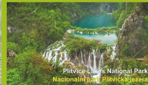
Plitvice Lakes National Park Nacionalni park Plitvička jezera