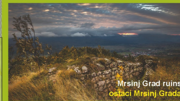
Mrsinj Grad ruins ostaci Mrsinj Grada